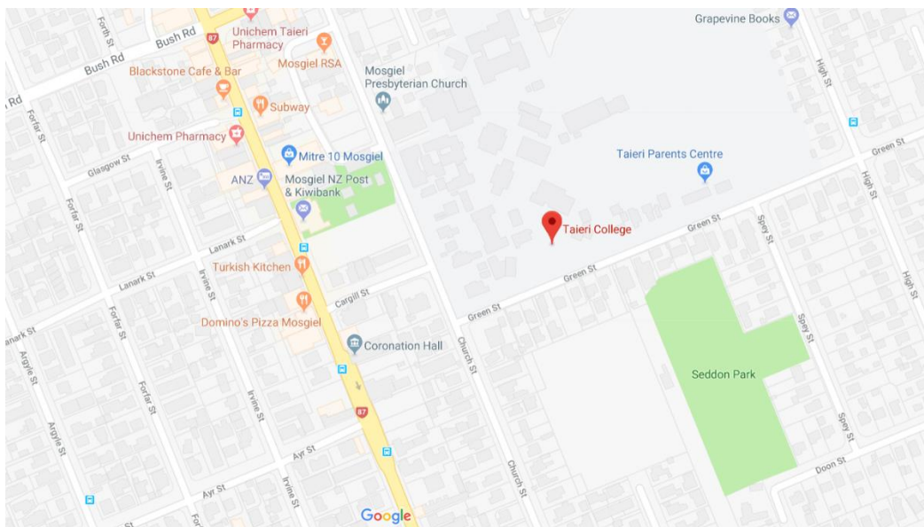
3 Green Street, Mosgiel